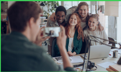
Contact us to start your journey